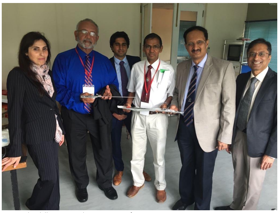
Visiting the skills center and presentation of equipment