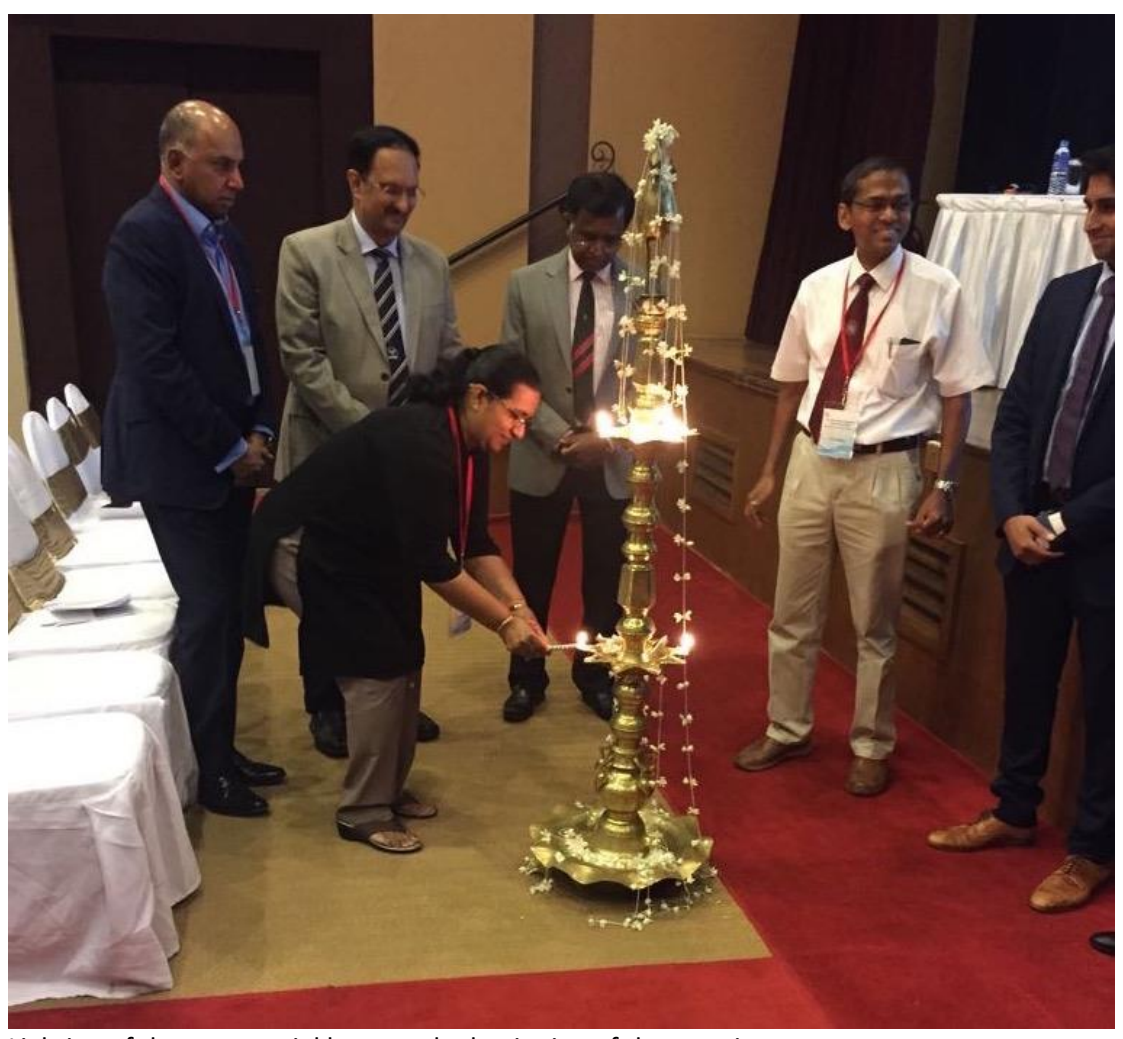
Lighting of the ceremonial lamp at the beginning of the meeting