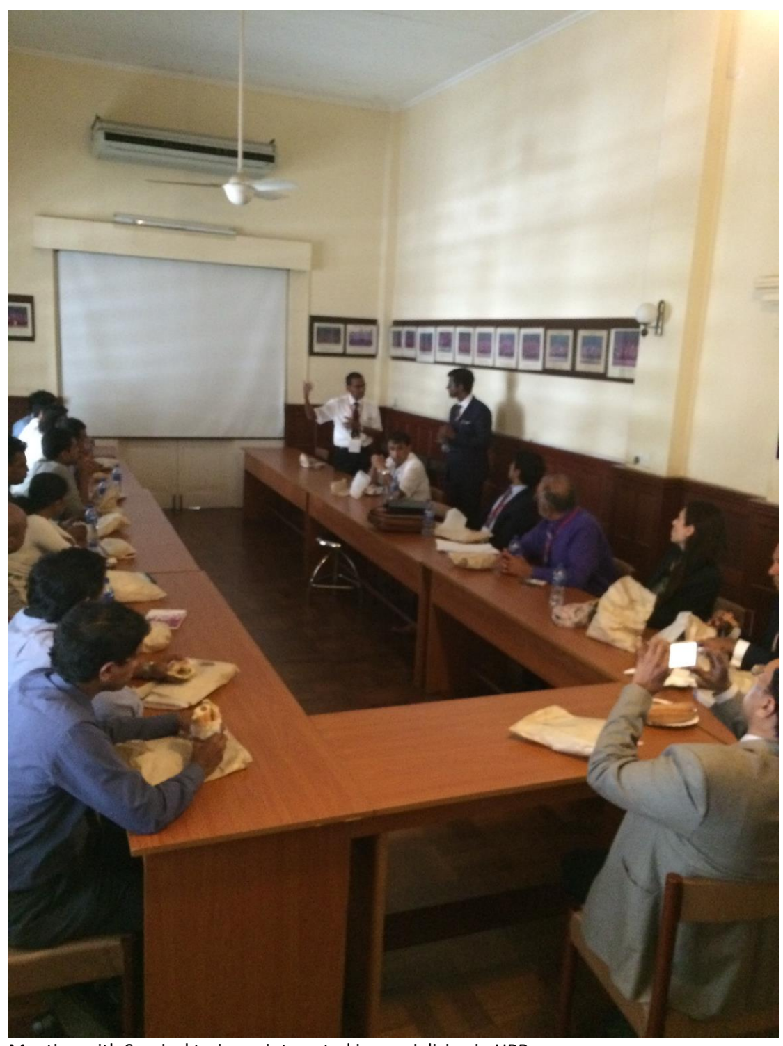
Meeting with Surgical trainees interested in specialising in HPB surgery